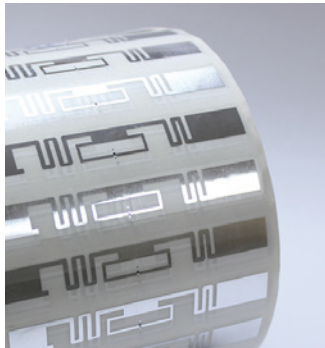
UHF RFID LABELS