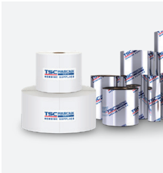
THERMAL PRINTING SOLUTIONS