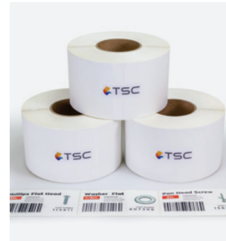
INKJET LABELS AND TANKS