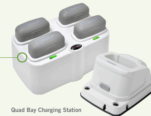
Quad Bay Charging Station