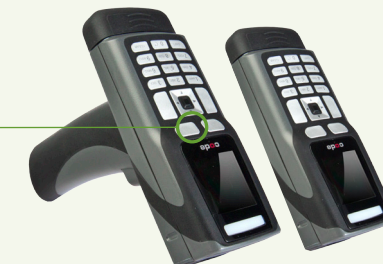
CR3600 DPM Handled