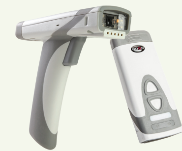
CR2600 XHD Handled